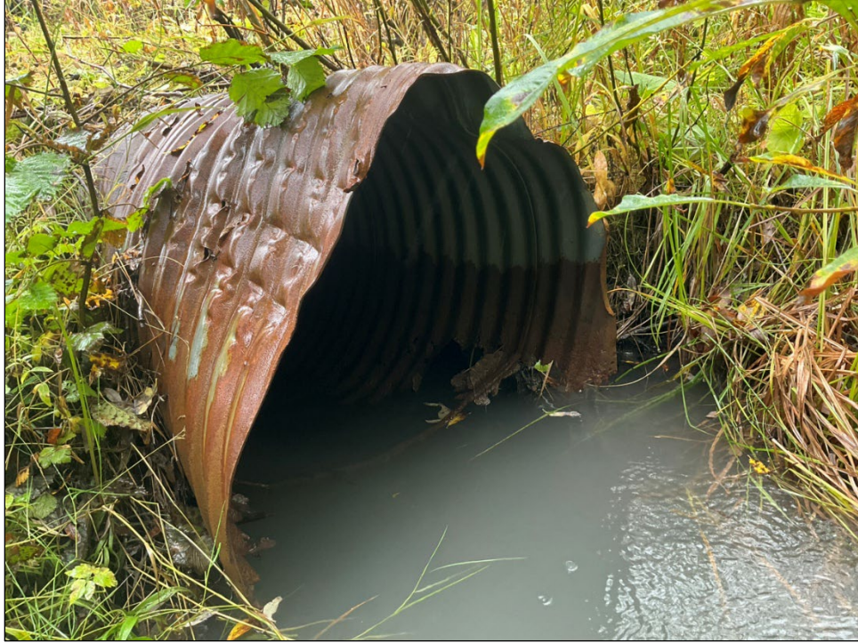
Figure 2.–Culvert inlet at waypoint 1249.