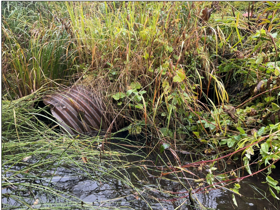
Figure 3.–Culvert outlet at waypoint 1249.