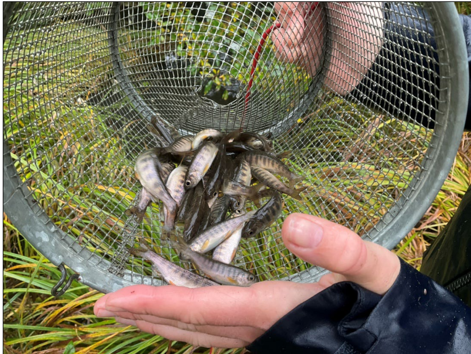
Figure 1.—Juvenile coho salmon captured at waypoint 1249.